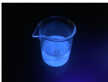
Silicon quantum dots under UV light

(wavelength number in the figure indicates the excitation wavelength)